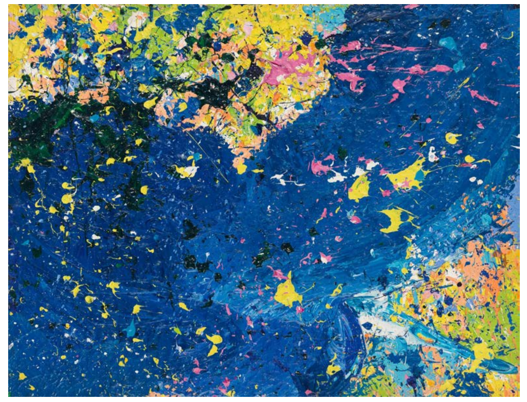
Walasse Ting, I Take Off My Pants Facing Sunset , 1969. Acrylic on canvas. 40.2 x 51.9 in / 102 x 132 cm. Courtesy of Private Collection, New York. JEFFREY STURGES

A colorful and wide-ranging retrospective of the Chinese American visual artist and poet might finally change that. The show, titled "Walasse Ting: Parrot Jungle," (<a href="https://nsuartmuseum.org/exhibition/walasse-ting-parrot-jungle/">https://nsuartmuseum.org/exhibition/walasse-ting-parrot-jungle/</a>) opened on November 10 at the NSU Art Museum in Fort Lauderdale, Florida, a one-hour drive north from Miami, and sheds light on an artist who spent nearly five decades living and working in Europe and United States across several styles and movements, but whose impact and influence was often overlooked.