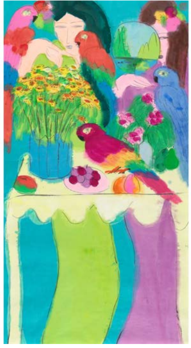
Walasse Ting, Untitled, early 1980s. Acrylic and Chinese ink on rice paper. 70 x 38 in / 177.8 x 96.5 cm. Private Collection, Hong Kong.

South Florida inspired many of the artist's "neon-soaked visions" of naked women, colorful animals, and vivid flowers.